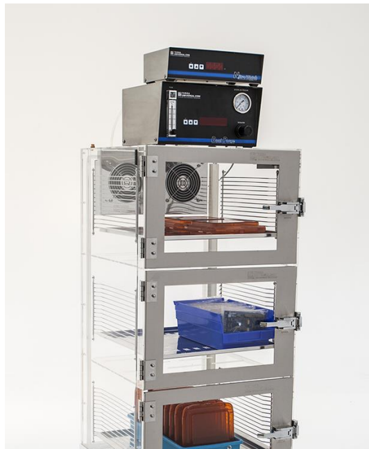
IsoDry™ Desiccator Cabinet (3-chamber, single-column design)